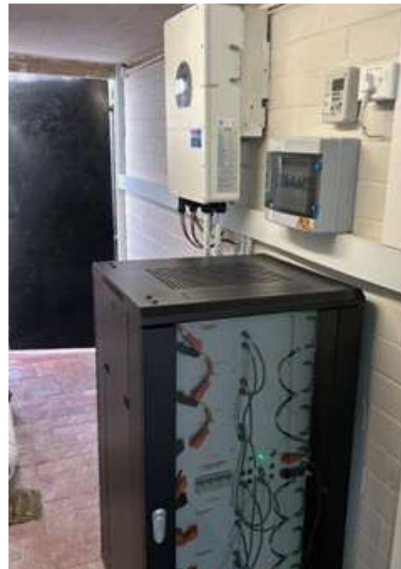
20KW 3P + 30KW LI HV