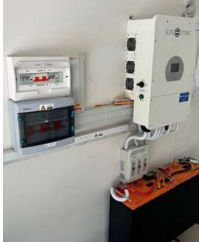
12KW 1P + 10KW LI BATTERY