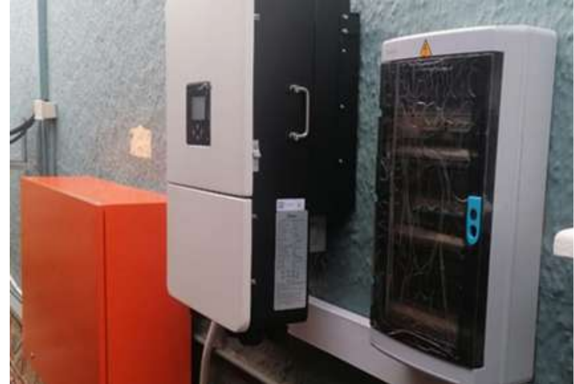
12KW 3P + 20KW LI BATTERY