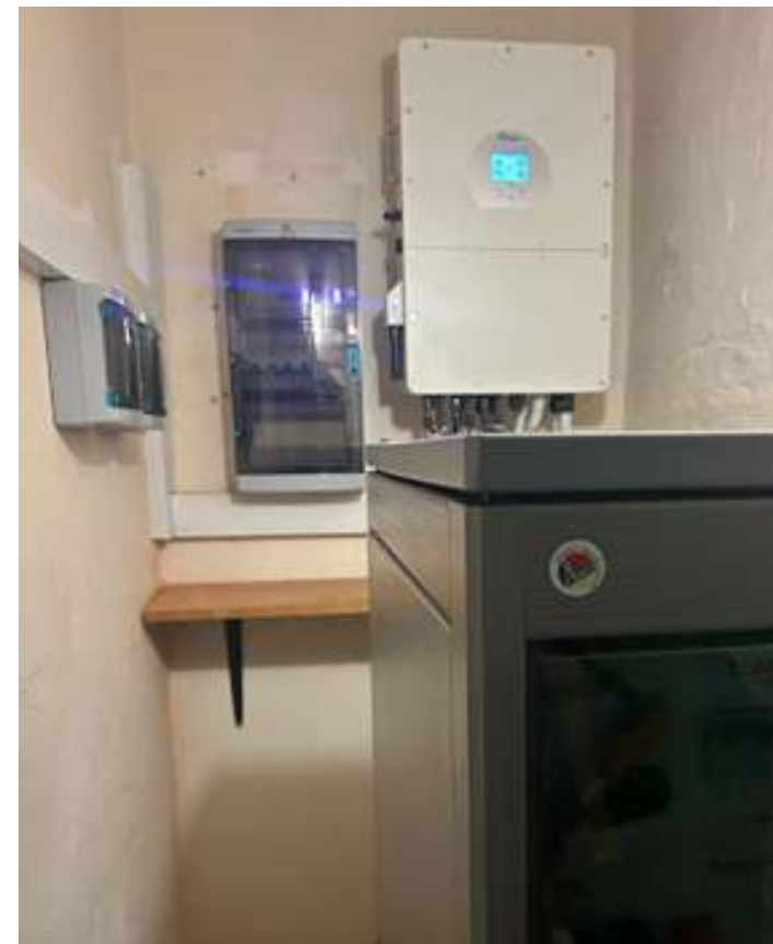
30KW HV + 30KW LI HV